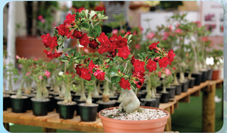
Double Flowered Desert Rose 1pc Adenium hybrids

We aren't happy if you aren't happy. If you have any questions regarding your order please call us at 1-765-525-4065 during the hours of 8:30 am and 4:30 pm EST.