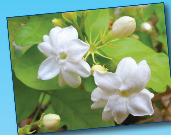
Philippine Jasmine ( Jasminum sambac )