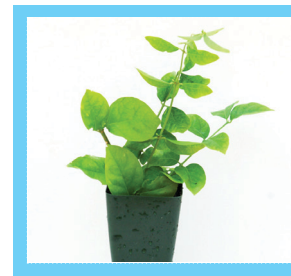
Jasmine Shipped As Shown