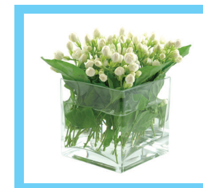
Vase of Jasmine