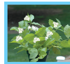
Philippine Jasmine 1st Season