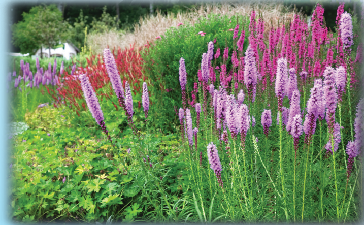
Liatris Blazing Star Liatris spicata