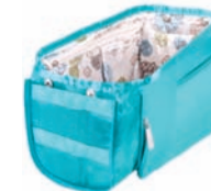
EXPANDABLE PURSE ORGANIZER