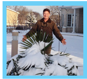
In the garden hardy to minus 15F