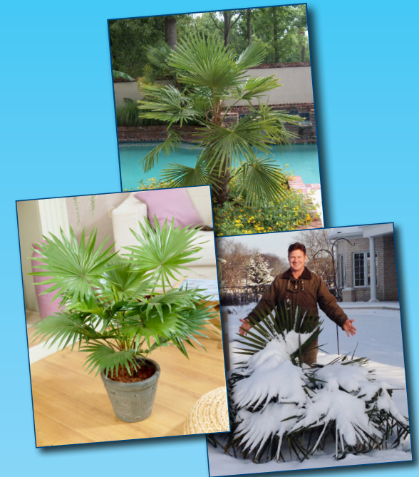
Hardy Chinese Windmill Palm (Trachycarpus fortunei)