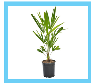
Windmill Palm shipped as shown