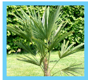
Windmill Palm 1 year old