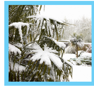
Mature 5 Year Old Windmill Palm