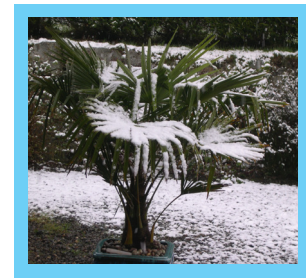
In containers hardy to 5F