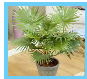
Established 1 Year Old Windmill Palm