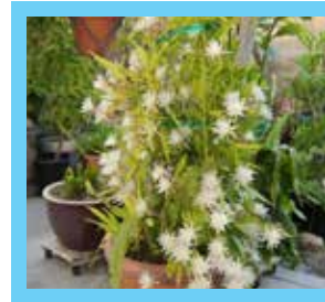
4 year old plant