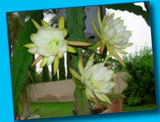
Fragrant Prickly Free Orchid Cactus ( Epiphyllum oxypetalum )