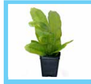
Orchid Cactus shipped as shown