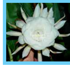
Flower size is huge