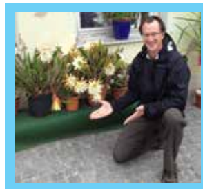
Long lived plant in Bavaria, Germany